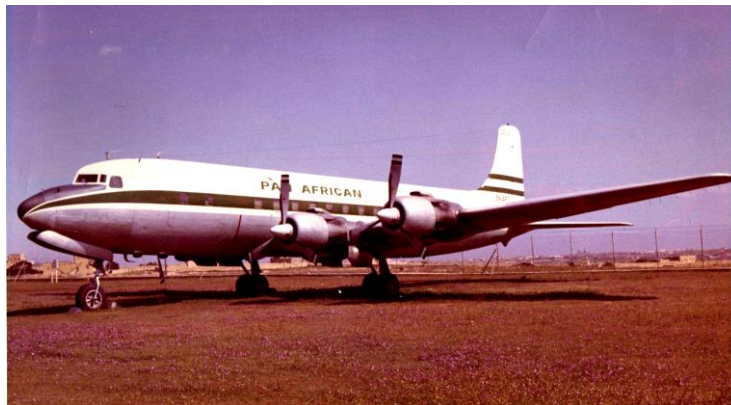
Pan African Airlines DC-6A 5N-AFT in 1969

Fate: lease of Air America DC-6A N90771 to Southern AT terminated in April 69 (Memo of 24 April 69, in: UTD/Bisson/B5, reel 4); not current in July 69 or later (Flight Operations Circular of 15 June 69, in: UTD/Hickler/B8F7B); so probably sold to Southern Air Transport in May 1969, possibly as an exchange for N90782; regd. to Southern Air Transport in the FAA's US Civil Aircraft Register of 1 July 69, p. 1675; sold to ALM, Aruba, as PJ-DSA in July 72; sold to TAMPA Colombia, Bogotá, as HK-1276 in 1973; sold to Aeronorte Colombia, Bogotá, in April 82; renamed Lineas Aéreas Sudamericanas, Bogotá, in 1986; leased to Aerosol Colombia, Bogotá, in January 91; returned to Lineas Aéreas Sudamericanas in January 92; sold to Agrocasa as HK-1276W in February 92; damaged beyond repair during an emergency landing at Mitu, Colombia, on 21 May 94.