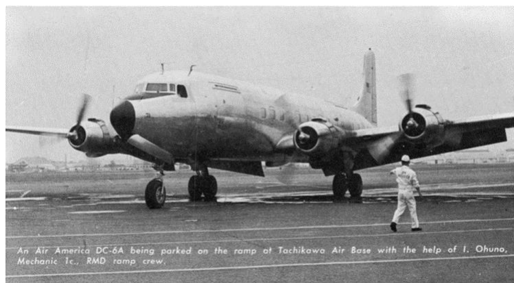
Air America DC-6A/B N90771 at Tachikawa in 1968/9 ( Air America Log , vol. III, no. 2, 1969, p. 1)