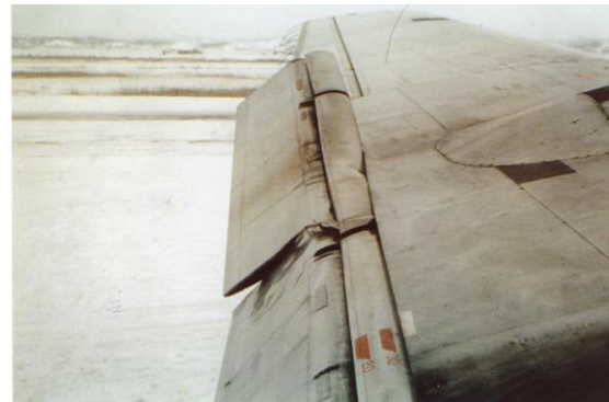
The flaps of N90781 at Osan after the 23 December 68 emergency landing

still assigned to the Booklift contract (-0231) for use out of Tachikawa, Japan, 16-30 June 69 (F.O.C. of 15 June 69, in: UTD/Hickler/B8F7B) and 16-31 August 69 (F.O.C. of 15 August 69, in: UTD/Hickler/B1F1); registered to Air America in the US Civil Aircraft Register of 1 July 69, p. 1675; arrived at Tainan on 29 June 70 in preparation for transfer/delivery to Southern Air Transport, Miami (Aircraft Information Circular of 1 July 70, in: UTD/Leary/B41F4).