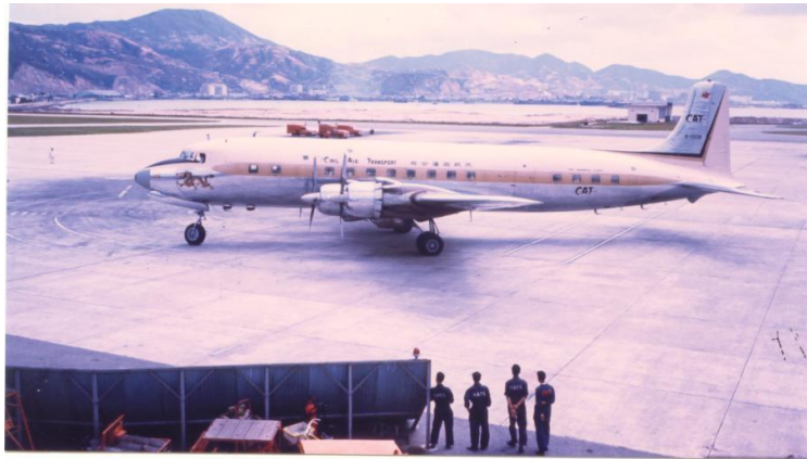
CAT DC-6B B-1006 at Hong Kong on 18 October 64

Fate: sold to Saber Air, Singapore, as 9V-BCI on 20 December 70; sold to Fragtflug, Reykjavik, as TF-OAE in October 72; crashed 4 kms east of Nürnberg, Germany, on 6 May 74.