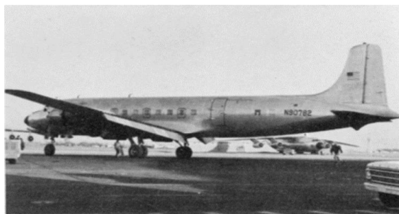
Air America DC-6A N90782

at Tachikawa in April 60 with titles