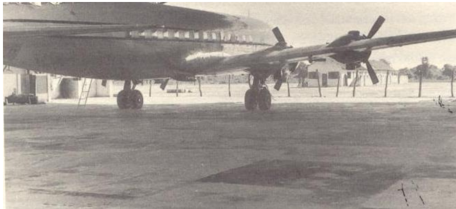
An unknown CAT / Air America C-118A at Kurmitola, East Pakistan, in 1958/9

Type registration / serial c/n (msn) date acquired origin