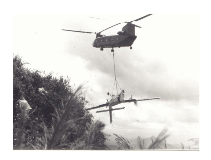
DHC-6 N389EX airlifted by Chinook 016 near LS-260 in April 74

DHC-6-300 N389EX 251 10 Jan. 72 Executive Airlines, Boston (National Energy Leasing)