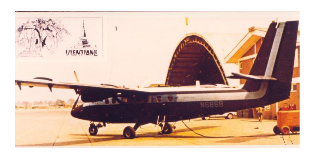
DHC-6 N6868 in night colors at Vientiane in March 74 ( Air America Log , vol. VIII, no. 2, 1974, p. 12)

DHC-6-300 N6868 235 26 Aug. 72 Interior Airways, Fairbanks, AK