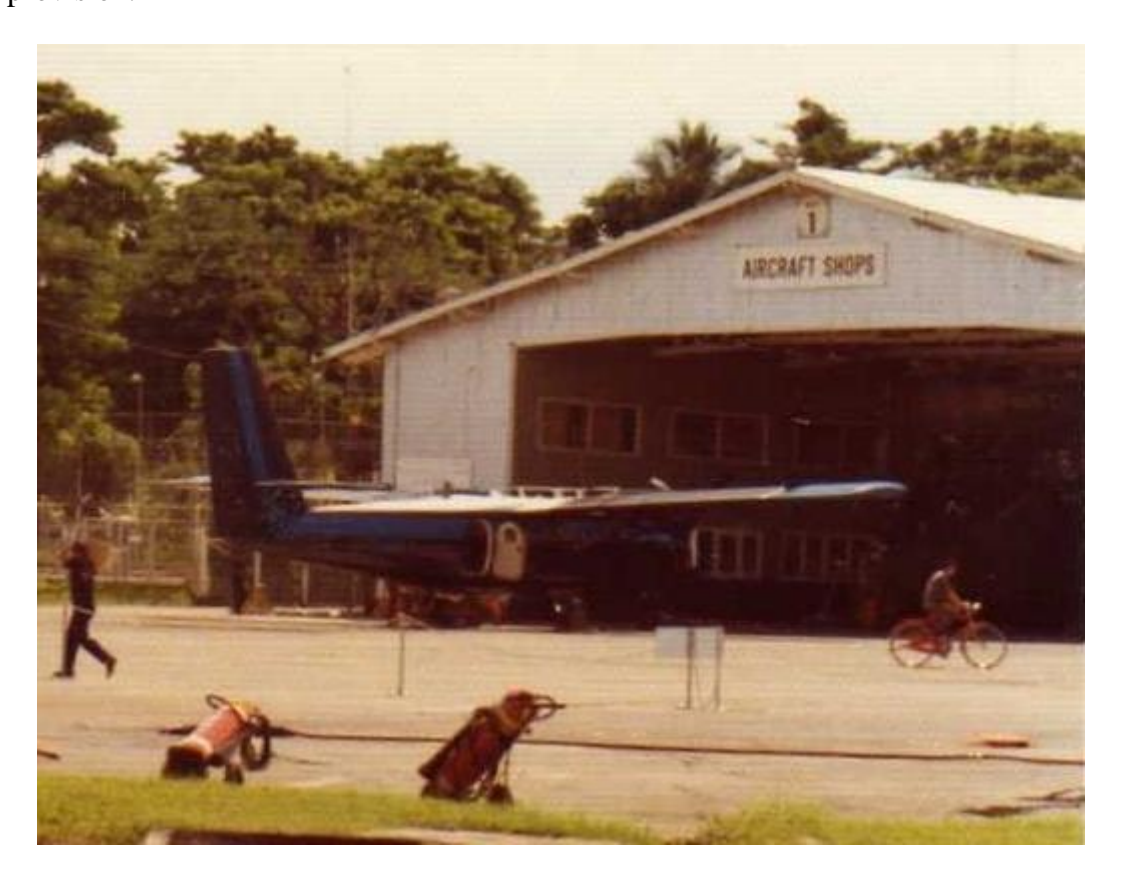
An unknown DHC-6 in night colors at Udorn in October 1973

Roswell NM between 9 and 26 September 75 (Air America, owned aircraft as of 30 September 75, in: UTD/CIA/B56F1); sold to Omni Aircraft Sales, Washington DC, at $ 275,000 according to the Sales Agreement of 13 November 75 (Summary of aircraft sales, in: UTD/CIA/B40F6); sold to Omni Aircraft Sales, Washington, DC, on 2 February 76 (Properties list dated 17 February 76, in: UTD/CIA/B18F9); deregistration requested on 6 February 76 (Letter by Clyde S. Carter dated 6 February 76, in: UTD/CIA/B16F9); arrived at Downsview on 2 April 76 for wingtip installation; the US registration was cancelled on 11 June 76; sold to Greenlandair Charter A/S, Godthab, as OY-POF in August 76; temp. regd. on 16 July 76; CofA on 29 October 76; regd. on 29 October 76; photo in Air-Britain Digest, Nov.-Dec. 81, p.141; leased to the Norwegian Antarctic Expedition on October 86; returned to Greenlandair in May 87; leased to Empire Airways, Coeur d'Alene, ID, on 26 June 91; returned to Greenlandair in December 91; current in 1998; now used for bulk fuel hauling and provision.