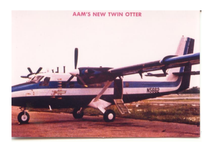
DHC-6 N5662 at Vientiane in 1972 ( Air America Log , vol. VI, no. 3, 1972, p. 1)