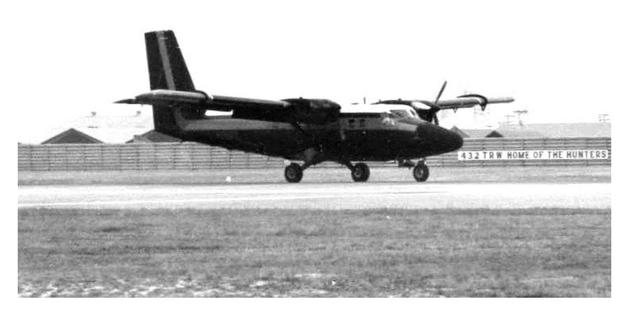
An unknown Air America DHC-6 in night colors at Udorn in 1973

First published on 15 August 2003, last updated on 24 August 2015